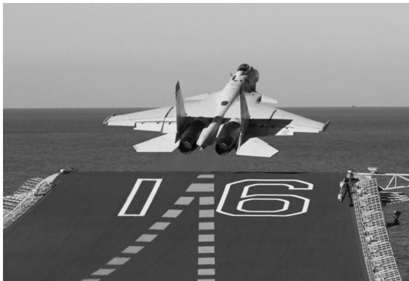
In this undated photo released by China's Xinhua News Agency, made available on Sunday, November 25, 2012, a carrier-borne J-15 fighter jet takes off from China's first aircraft carrier, the Liaoning .