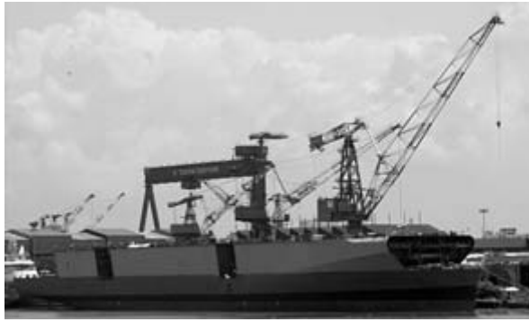
The Indigenous Aircraft Carrier (IAC) being constructed at the Cochin Shipyard