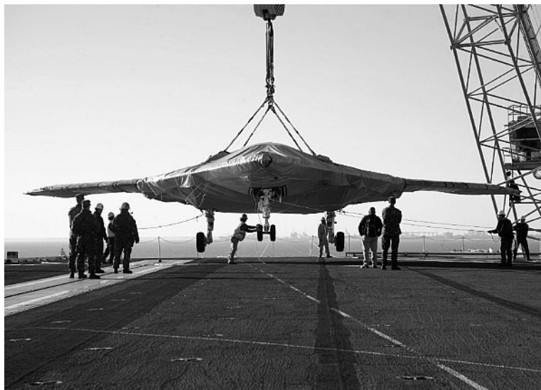
U.S. Navy Sailors assist with the onload of the X-47B Unmanned Combat Air System (UCAS) demonstrator aboard the aircraft carrier USS Harry S. Truman (CVN 75)

Refer to the article: U.S. Navy Testing Carrier-Based Unmanned Aircraft http://gcaptain.com/us-navy-testing-carrier-based-unmanned-aircraft/