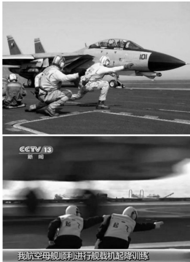
This frame grab taken from Chinese television CCTV on November 27, 2012 shows undated video broadcast on November 25 of two crew members directing a Chinese-made J-15 fighter jet as it takes off from the deck of the Liaoning , China's first aircraft carrier.