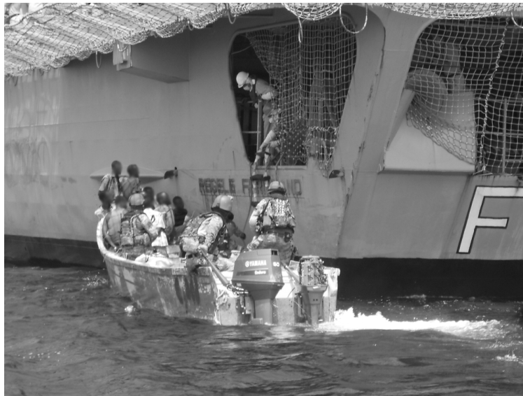
The boarding team from ROS Regele Ferdinand brings the apprehended pirates and their skiff back to the Romanian warship

Source: EU NAVFOR Public Affairs Office, Press Release, November 21, 2012